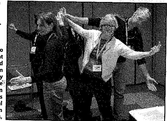
Embodied Sculpted Analysis. Based on Augusto Boal's Image Theatre techniques, spect-actors at a 2011 NAEA Women's Caucus session performed and directed each other to form body poses from their interpretation of constellations of survey data in response to the question "What is the image of a feminist in the field of art education today?" A premise of Image Theatre techniques for embodied sculpted analysis is that individual transformation incites and mobilizes action toward societal change.

The Women's Caucus 2011 Lobby Session took place, as has been the Convention tradition since 2008, in the Sheraton Seattle lobby. Using prompts that began "a time when," the 50 participants worked in small groups to translate personal experiences into possible pedagogical or political actions. Groups summarized their discussions emphasizing empowerment is in having relationships and being able to talk to others, learning from each other's life stories, acting on what you believe, and making decisions. Transcript available at http://naeawc.net/activism.html.