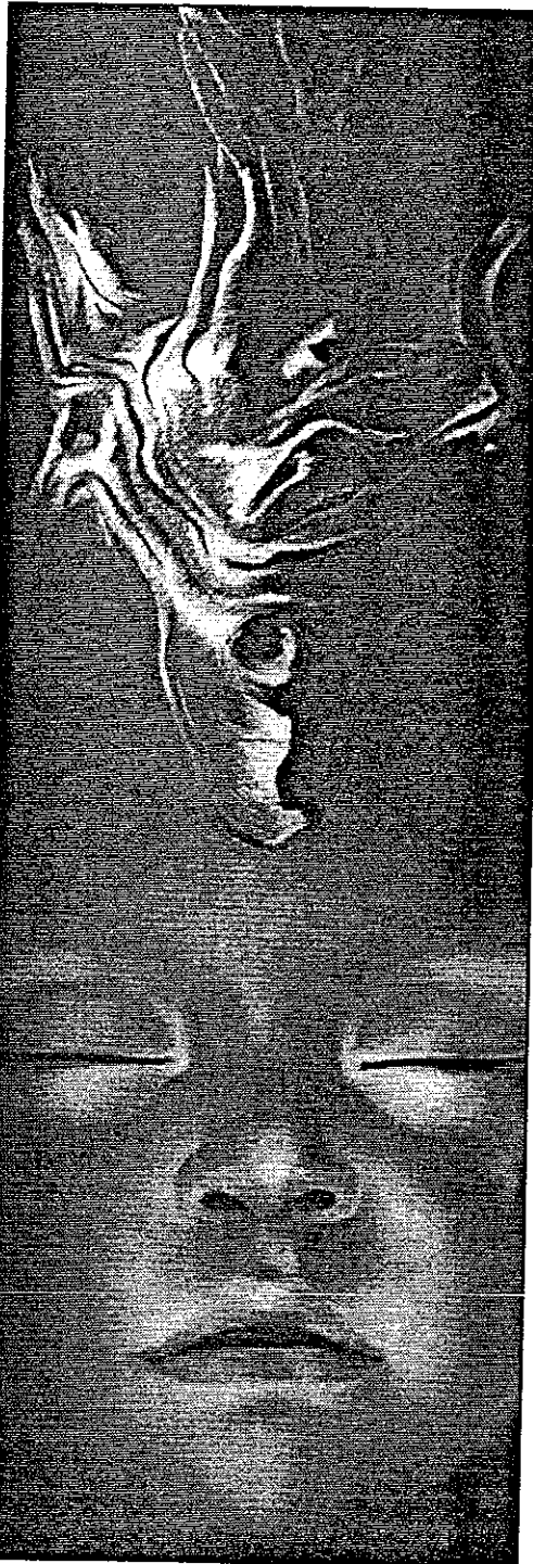
Bare Bones 16