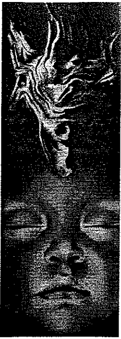
Bare Bones 16