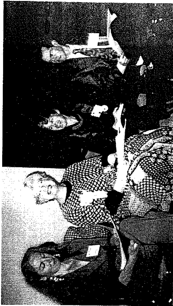
At the Women's Caucus Business Meeting