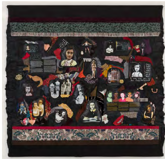
Anne Frank #839 by Linda Stein (2015). Fabric, archival pigment on canvas, leather, metal, zippers, 5 ft. sq. Encounter http://h2f2encounter.s.cyberhouse.emitto.net/justice/