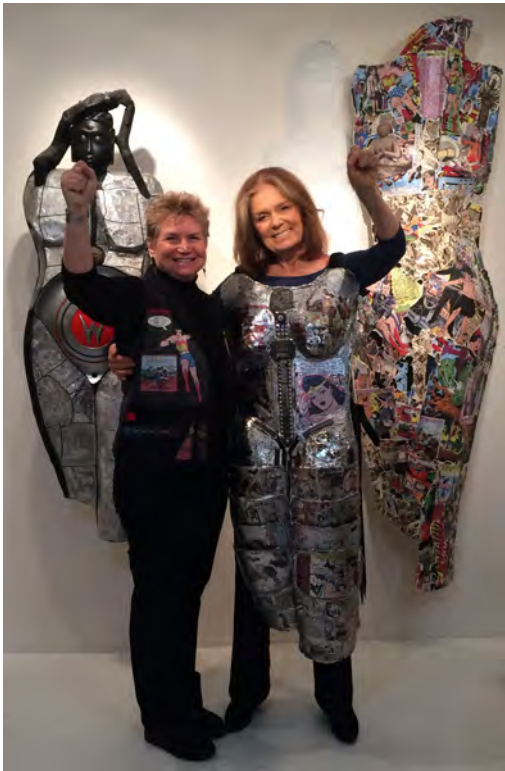
Linda Stein with Gloria Steinem wearing Stein's Fluidity of Gender sculpture (2015).